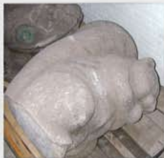
WPA Critters Historic Preservation