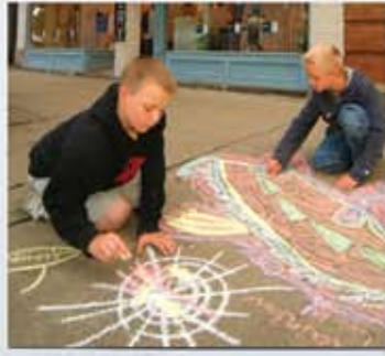
Taste of Tremont