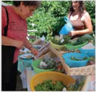
Tremont Farmers Market