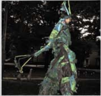
Tremont Arts and Cultural Festival